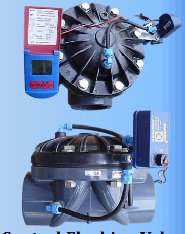
Control Flushing Valve